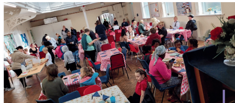
Families gathering for our termly cooked breakfast fry up