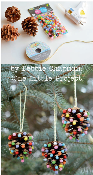
by Debbie Chapman, (One Little Project)

Repeat for all the the pinecone tips. Then take about 11" of string or ribbon and hot glue it to the top of the pinecone. Job done!