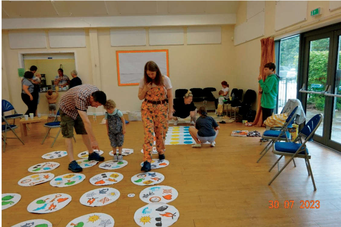
Hope Church Picnic 30 th July

At the time of writing, Hope Church is having its usual 2-week August break but, before this started, we had a church picnic in the Community Centre. If the weather had been fine, we would have been outside on the Green by the Centre but there were simply too many showers to chance it. However, a good time was had by all, the children playing with a variety of indoor games and toys and the adults enjoying a hot drink, biscuits and a chance to chat.