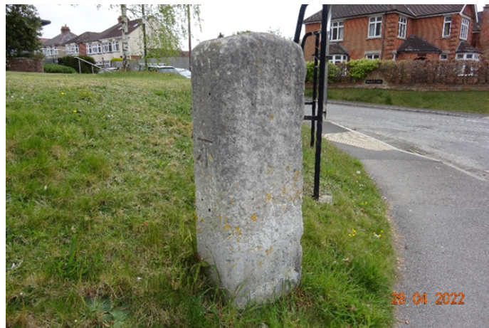
The St Francis milestone: the benchmark can be seen on the left side

Since March 1990 this stone has been classed as a Grade II listed building. It is, in fact, one of a series of milestones to be found between Salisbury and Amesbury along the A345. This road was turnpiked by the Marlborough and Salisbury Trust in the 1750s, so the milestone predates this by a few years. The St Francis milestone is the first of the milestones to be encountered on a journey out of Salisbury, as it is exactly one mile from the city centre (the market place). Next time you travel along the A345 to Amesbury see how many of these milestones you can spot.